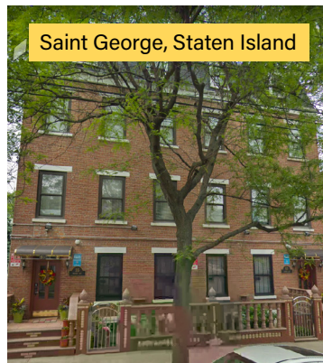
Saint George, Staten Island